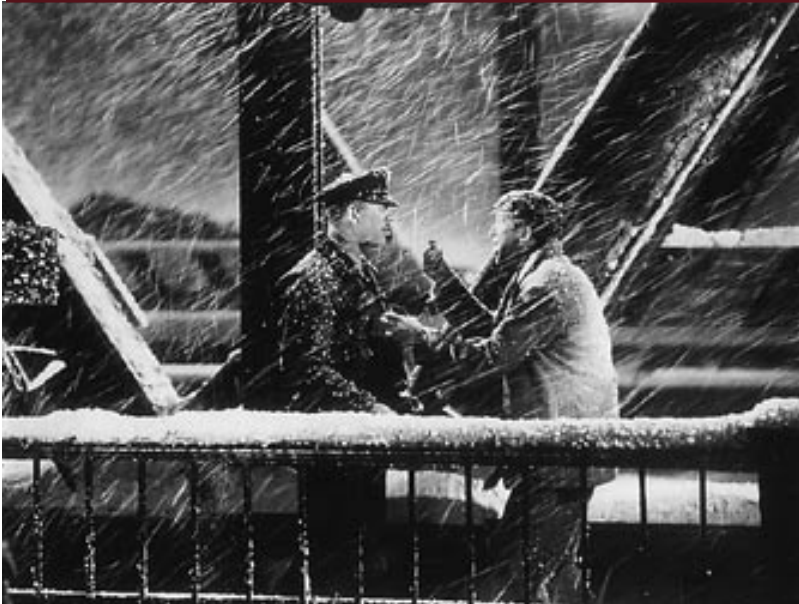
Officer Bert (Ward Bond) and George (Jimmy Stewart)

and manages to stem the rush by paying people back out of his honeymoon money. So Mary and George cannot go on their honeymoon. But the good news is they have bought a house. But the bad news is that it is incredibly run down. And the worse news is that Potter is trying every trick in the proverbial book to take over the Bailey business. George just barely turns down an offer to work for Potter and returns home to the news that Mary is pregnant.