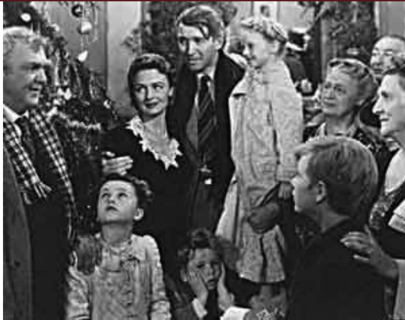
Uncle Billy (Thomas Mitchell), Mary (Donna Reed), George (Jimmy Stewart), and the family

MRS. HATCH mother of MARY, mother-in-law of GEORGE