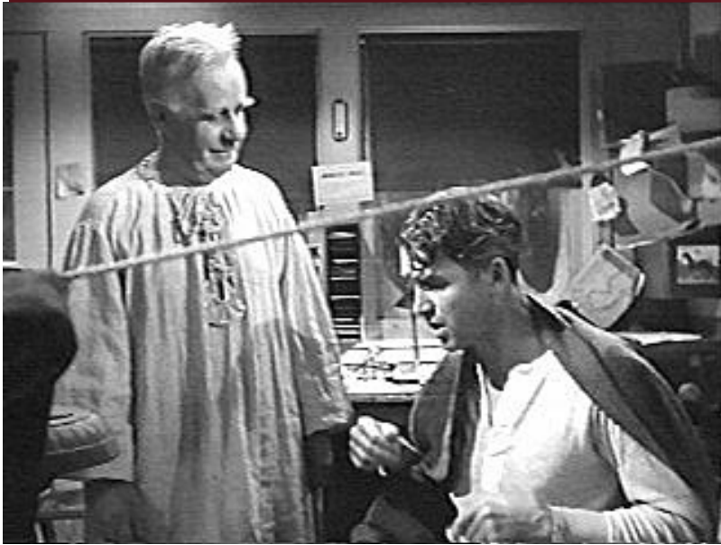
Clarence (Henry Travers) and George (Jimmy Stewart)

years of exemplary stage management for Portland Center Stage, she is moving on to the next stage of her life. Whatever that turns out to be, we all wish her the best. With any luck, audiences will not notice her absence from the house, which will only be a testament to the extraordinary quality of her invisible yet inestimable work.