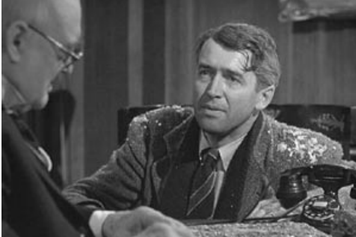
Potter (Lionel Barrymore) and George (Jimmy Stewart)