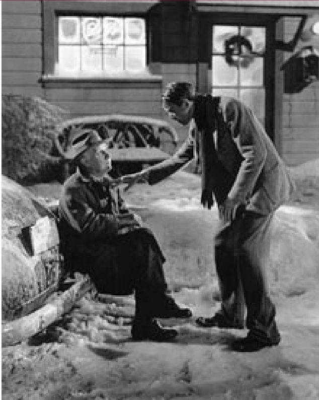
Clarence (Henry Travers) and George (Jimmy Stewart)