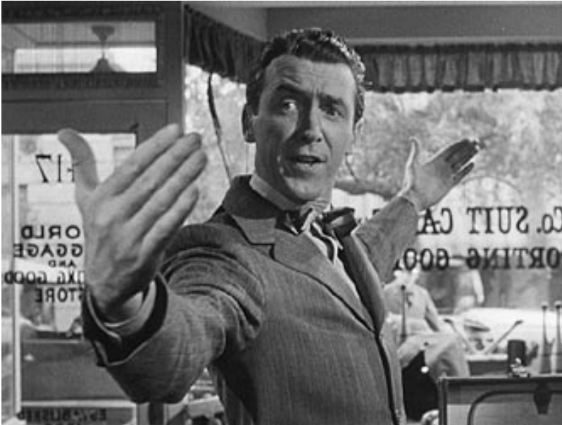
George (Jimmy Stewart)

—Frank Capra, responding to a 1956 fan letter