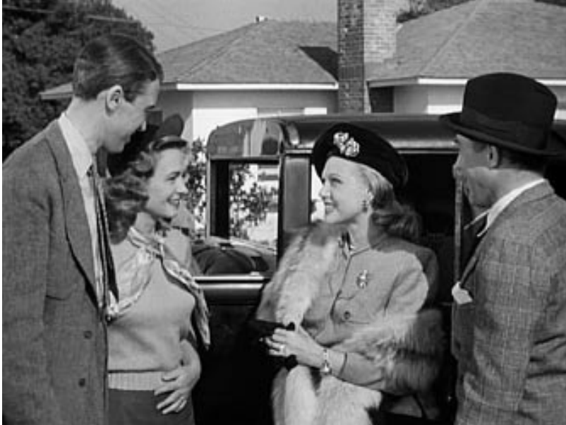
George (Jimmy Stewart), Mary (Donna Reed), and a neighbor. (please email webmaster@pcs.org if you know who!)

the place to find out what will happen before it does