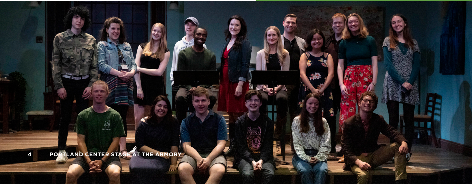
Photos: Visions & Voices 2019 group.