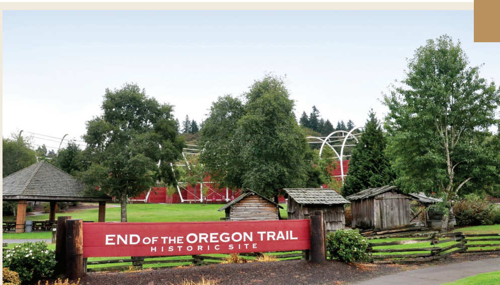
End of the Oregon Trail Interpretive & Visitor Information Center

Return to Baker City and stay at Baker City Blue Door Inn .