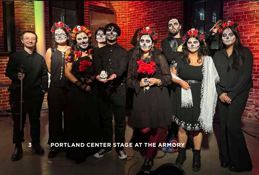
PORTLAND CENTER STAGE AT THE ARMORY