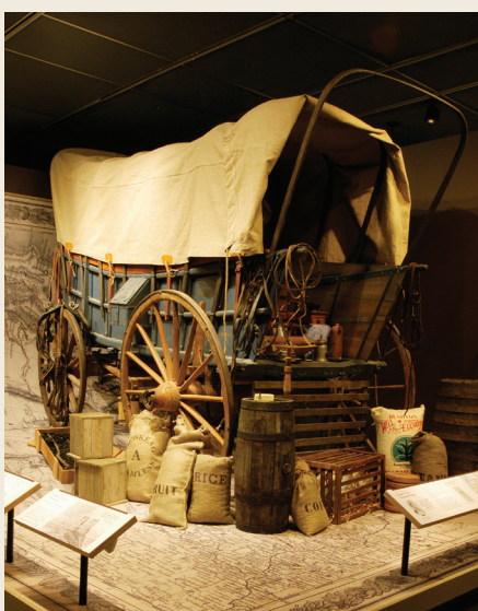
The Oregon Historical Society