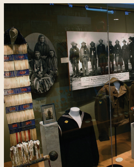
Tamástslikt Cultural Institute