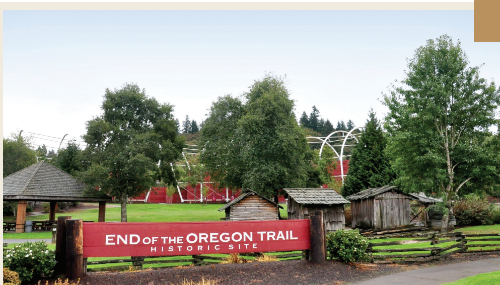
End of the Oregon Trail Interpretive & Visitor Information Center

Return to Baker City and stay at Baker City Blue Door Inn .